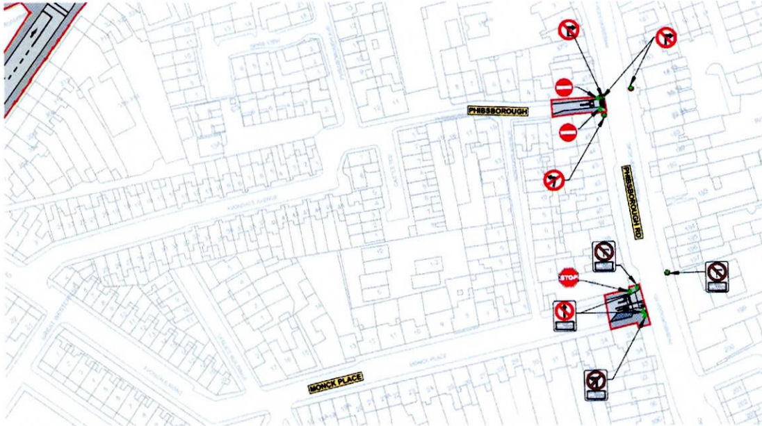
Extract of Bus Connects Plan to restrict traffic flow at Phibsborough Road, Monck Place & Avondale Avenue ('Phibsborough')

The roads at Monck Place, Avondale Road & Avondale Avenue have now been included in the Bus Connects scope of application, with proposed traffic movement restrictions now applied to these roads to prevent the future misuse of these roads for rat-running traffic: