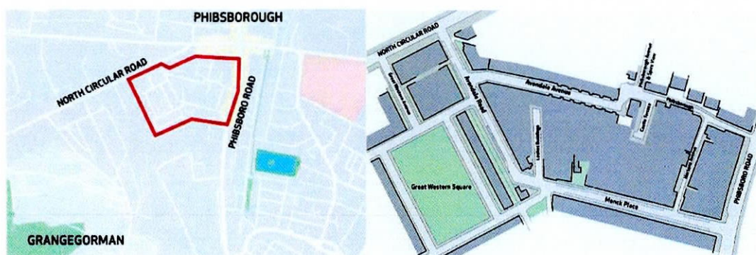
Red line Outline of environs of Monck Place, Avondale Road, Avondale Avenue, Leslie's Buildings and Great Western Square (left) and detail plan layout of streets (right)

The proposed alterations to vehicular traffic movement to the local network of streets in which I reside contained in the Bus Connects Blanchardstown to City Centre Core Bus Corridor Scheme reflect a resolution of my concerns.