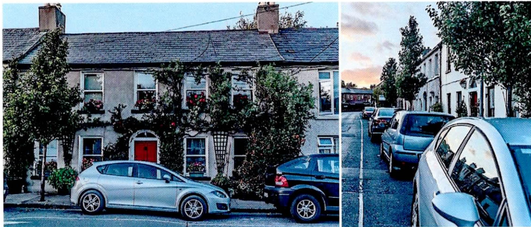
Images of community improvements & environmental efforts of upgrade, Monck Place

Bus Connects is a significant infrastructural project that has a clear logic to induce a more sustainable urban transport modal shift. I support the decarbonising of movement for the City's residents. In this observation I note that in tandem with the wider Bus Connects Objective, the protection and improvement of quality of local environments that are affected by the Bus Connects scheme is also paramount. Both objectives are mutually compatible and I support how the Bus Connects plan has managed these resolution of both as the relate to my local area.